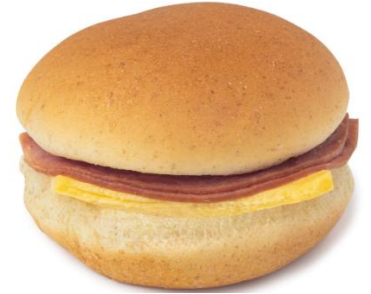
PRODUCT SHOWN UNWRAPPED

*The % Daily Value tells you how much a nutrient in a serving of food contributes to a daily diet. 2,000 calories a day is used for general nutrition advice.