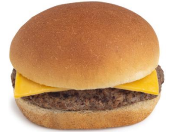
PRODUCT SHOWN UNWRAPPED

*The % Daily Value tells you how much a nutrient in a serving of food contributes to a daily diet. 2,000 calories a day is used for general nutrition advice.